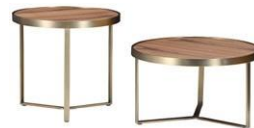
EASY C14692, E14692