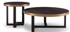
BILBAO E15847-001, C15847-001