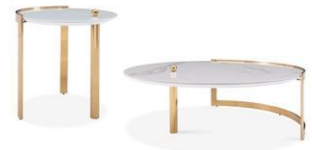
BELGRADO E20054, C20054