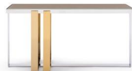
ART DECO CS15891