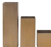
FLOWER SQUARE PT18002ABC