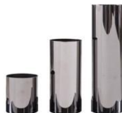
FLOWER CIRCLE PT18001ABC